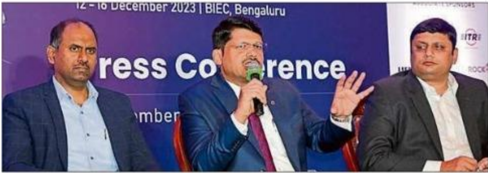
CII representatives at a press meet on the 12th edition of EXCON, in Bengaluru on Monday.