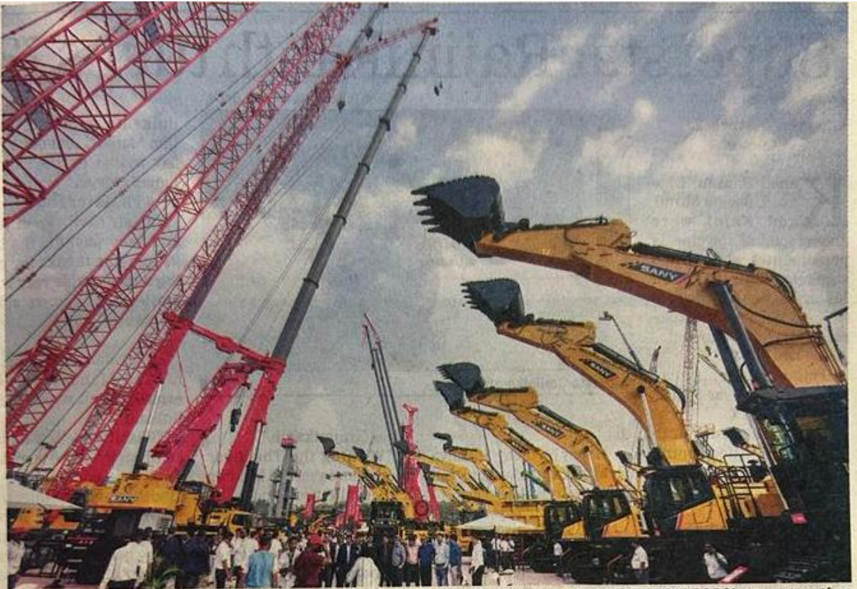
A display of earthmovers and other heavy machinery during the inauguration of 'EXCON 2023', a construction equipment exhibition, at BIEC in Bengaluru, Tuesday