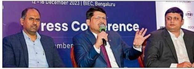
CII representatives at a press meet on the 12th edition of EXCON, in Bengaluru on Monday.