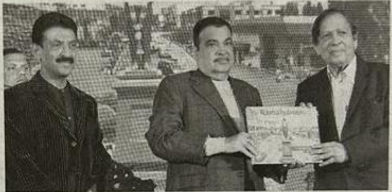
Union Minister for Road Transport and Highways Nitin Jairam Gadkari with former Lokayukta Justice N Santosh Hegde during the release of a book in Bengaluru on Tuesday

Stating that there is a competition with China, the Union Minister said