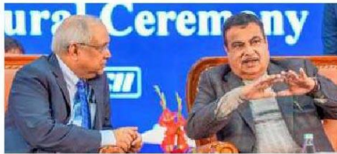
VAST POTENTIAL. Union Minister for Road Transport and Highways Nitin Gadkari with CII Director-General Chandrajit Banerjee during inauguration of 'Excon 2023'

The Union Minister was speaking at the inauguration of Excon, a construction equipment trade fair conducted in Bengaluru. "India's construction sector currently is the world's third-largest. By fostering collaborative endeavors among stakeholders and corporations, and through substantial government sup-